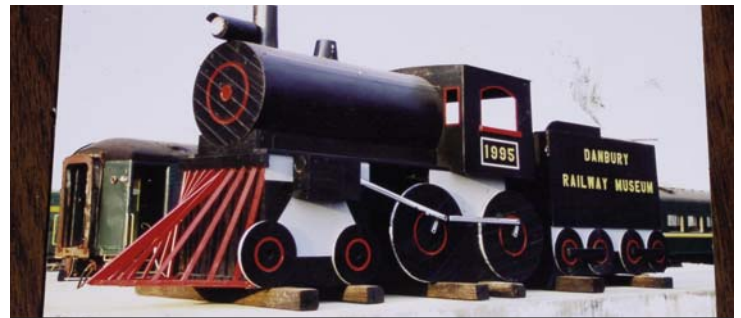
The float, when new, in a photo from the Still River exhibit at the DRM. Now, as very noticable display near the rear railyard gate, it desperately needs rebuilding.

The DRM participated in the Newtown Labor Day Parade. Our wooden locomotive float was used and came away with the prize of Best Float. Local newspapers covered the event.