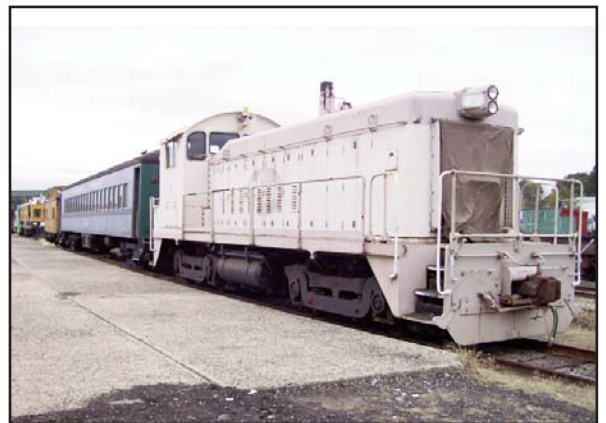
Running again on Tracks 42 and 34!