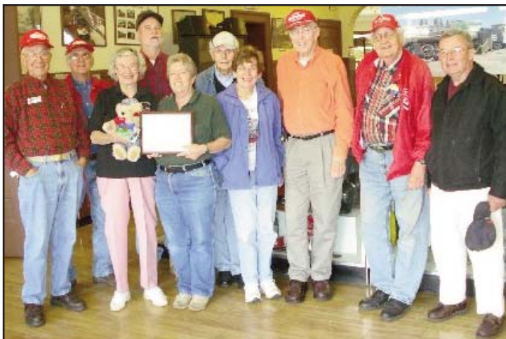
Gathering of well-wishers.