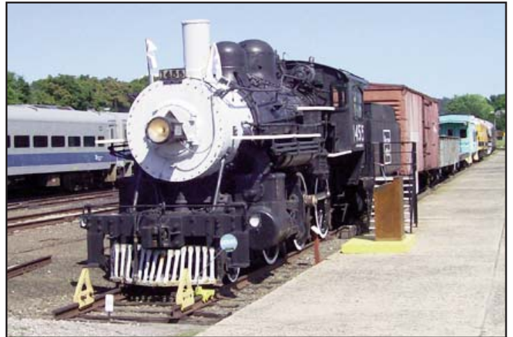
The #1455 flying white Special Train flags on Danbury Railway Day in August 2007.

The other big new item was the purchase of Boston & Maine 2-6-0 #1455 on March 4, 1999. Completed in November 1907, the engine served