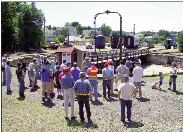
The DRM turntable being dedicated as an historic landmark in August 2007.