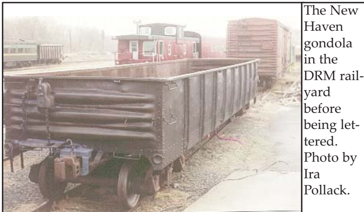
The New Haven gondola in the DRM rail-yard before being lettered.

installation of their snow plow. Warmer weather would see the car fully painted and lettered. The