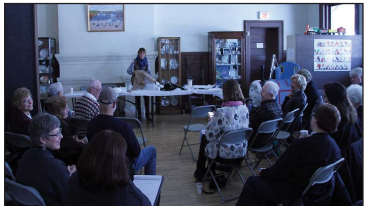
Above Photos: Members of the CLHO Collections Colleague Circle at the DRM listening to a lecture.