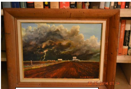
Not just railroading