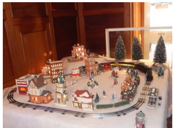
CHRISTMAS OUTSIDE IN THE YARD AND INSIDE IN THE SANTA CAR